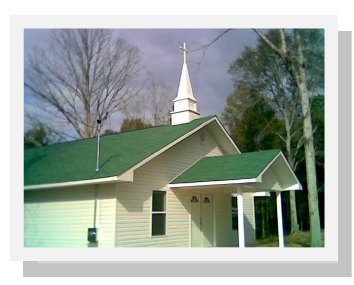
White Oak Chapel

experiences, but from time to time we need a place to get out of our comfort zone for the "soul"